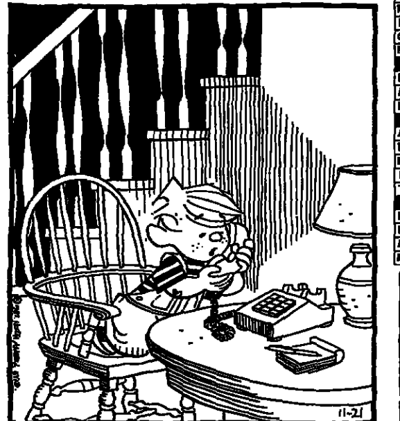
"CAN YOU CALL BACK LATER? MY MOM AND DAD ARE HAVIN' AN ARGUMENT ABOUT WHOSE FAULT I AM."